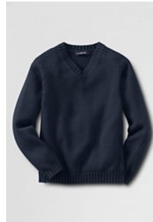
Navy V-Neck Sweater (FOH #6500 and LE)

Sweaters should be worn over a uniform shirt.