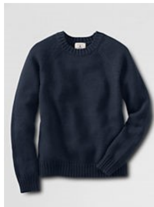
Navy Crew Neck Sweater (FOH #6530 ) Sweaters should be worn over a uniform shirt.