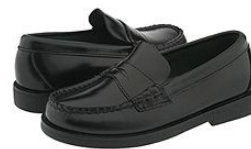
Black or brown dress shoes with a black or brown sole. Solid black, brown, or navy socks (non-athletic)