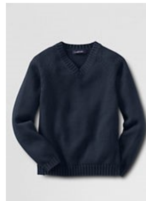
Navy V-Neck Sweater (LE and FOH #1001) Sweaters should be worn over a uniform shirt.