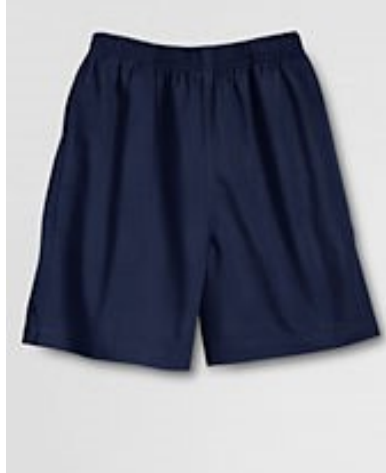
Girls Navy Mesh Shorts