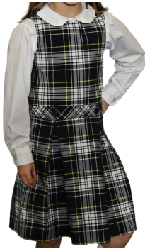
Plaid Jumper (FOH Style #94, Plaid #45)

Navy or black bike shorts worn under jumper for modesty. (any source)