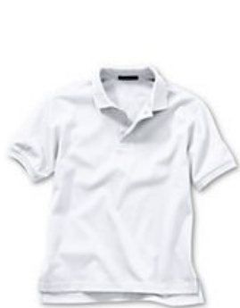
Cotton Polo, long or short sleeved, white or navy (LE or FOH)