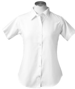
Oxford Cloth Blouse (white) (FOH or LE)