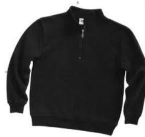
Navy Fleece Jacket: Full or half zip. Must have school logo (LE). Please note that only the new logo will now be accepted. Fleece may be worn in the classroom.