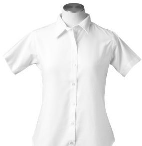
Oxford Cloth Blouse (white) (LE & FOH)