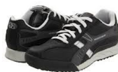
Solid or mostly white or black sneakers-no gray (any source). No neon on shoes or soles.