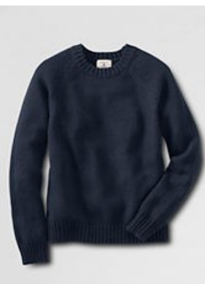
Navy Crew Neck Sweater (FOH #6530 )

Sweaters should be worn over a uniform shirt.