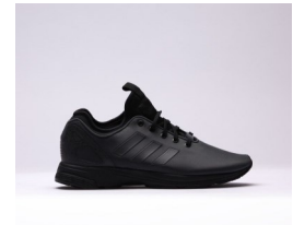
Solid or mostly white or black sneakers-no gray (any source). No neon on shoes or soles.