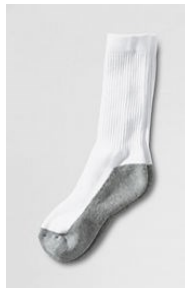
White or navy knee socks or white crew socks (any source). Crew socks must cover ankle.

Boys and girls in 3rd -6th must wear belts when wearing pants.