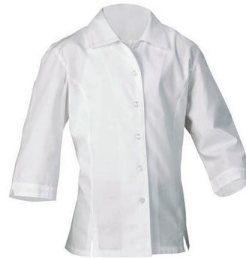
3/4 length sleeve white camp shirt (FOH)