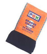
Navy opaque tights may be worn throughout the year.