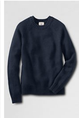
Navy Crew Neck Sweater (FOH or LE)