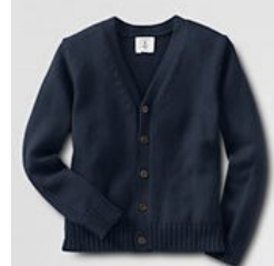
Navy button-front cardigan sweater (FOH #1001)