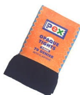
Navy opaque tights may be worn as daily wear.