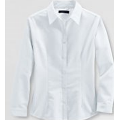
Long or short sleeved white oxford cloth shirt (any source)