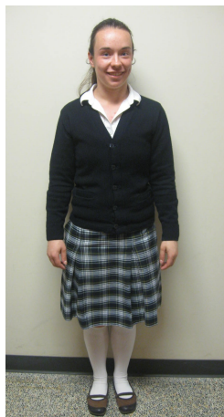
Plaid Skirt Style #34, Plaid #61, extra length* (FOH)

*The extra length should be ordered unless this would cause the skirt to fall well below the knee.