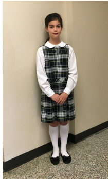
Plaid Jumper FOH Style #94, Plaid #45

Navy or black bike shorts worn under jumper for modesty. (any source)