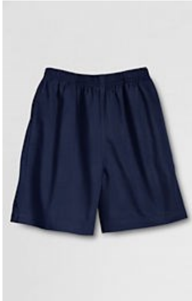
Navy Mesh Shorts (LE #470208)

Covenant PE shirt to be ordered through the school spirit wear store (DiscoverCovenant.store) by August 7 to ensure timely delivery. Students in 4th-12th grade should have this shirt for the first day of gym class. No other shirts are permitted for PE class.