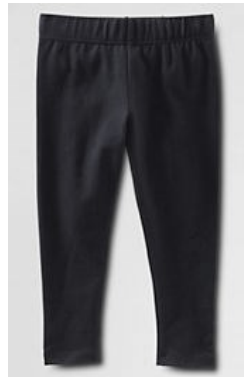
Navy Leggings (LE)

Leggings always per- mitted in cold weather.