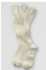
White or navy knee socks (any source)

*The extra length should be ordered unless this would cause the skirt to fall well below the knee.