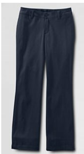
Classic navy plain or pleated front chinos (LE) Pants may be worn November 1-April 15.