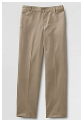
Khaki twill classics (FOH) or pleat or plain front chinos (LE)