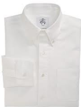
Long or short sleeved white or light blue button down collar oxford shirt (FOH or LE #458479)