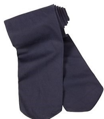
Navy opaque tights may be worn for daily wear.