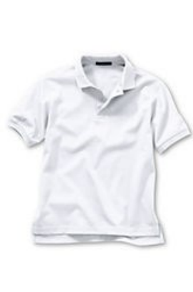
Cotton Polo, long or short sleeved, white or navy (LE or FOH)