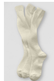
White or navy knee socks. (any source)