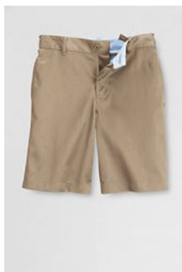
Khaki Short: Pleat or plain front (FOH or LE)

Shorts may be worn before November 1 and after April 15.