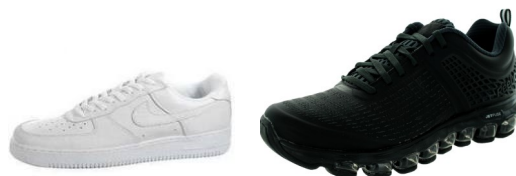
Solid or mostly white or black sneakers-no gray (any source). No neon allowed on shoes or soles.

Solid black, brown, navy, or white socks. (Crew socks must cover ankle)