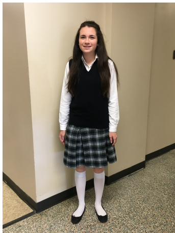
Plaid Skirt FOH Style #34, Plaid #61, extra length*

*The extra length should be ordered unless this would cause the skirt to fall well below the knee.